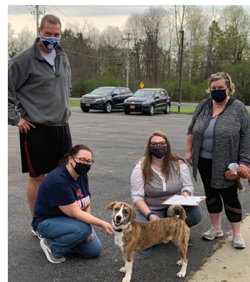
Declin with his foster family and his new adopted family.

Declin came to APF in early 2021 and found a home quickly, unfortunately as it sometimes happens, this wasn't the best fit for him. Being back at the shelter caused him to have social anxiety and other behavioral concerns. Our staff worked with him to try and ease his anxiety but they knew a foster home would be the best way for Declin to adjust to home life.