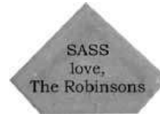
12" Granite Brick